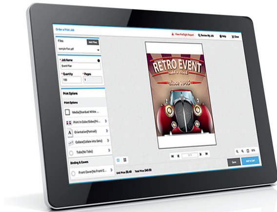
Visual Product Builder is HTML5 and desktop, tablet and mobile ready.