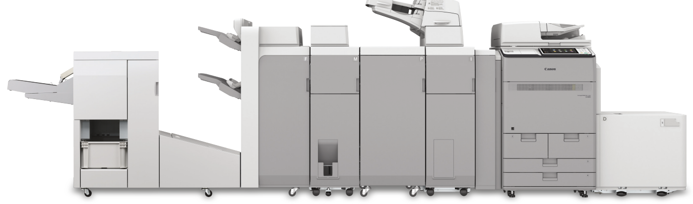
imagePRESS Lite C165 shown with optional accessories.

From professional punching to folding and saddle-stitching, you can have the ability to satisfy more people and keep more in-house.